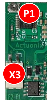
Bottom View – P1 Current Limit Control Potentiometer