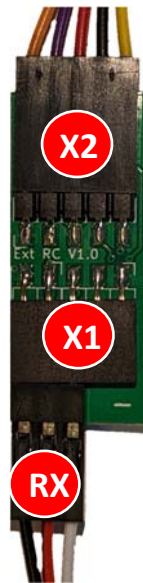
Top View – RC Receiver Power Only